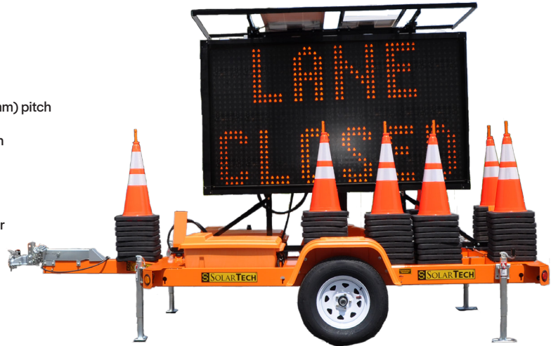
Custom Colors Available