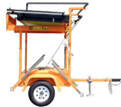
MB-III lowered and folded compactly for transport.