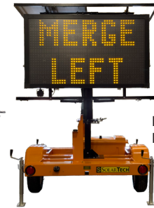
MB-III Lift & Rotate