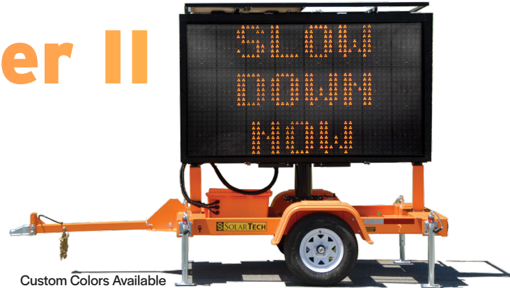
Custom Colors Available