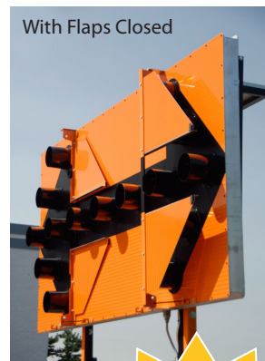
With Flaps Closed