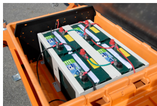
Anti-theft steel battery frame