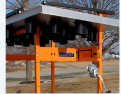
Side Rail Controller