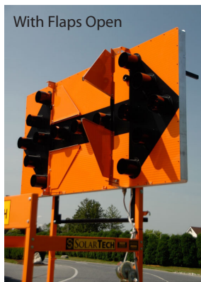
With Flaps Open